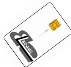
DATA CARD FOR TRACKING