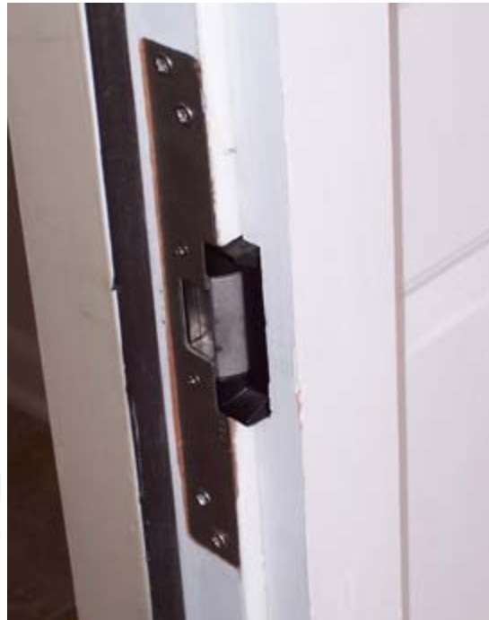
Electric strike mounts on door frame.