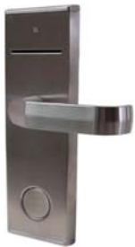
OUTSIDE LOCK BODY