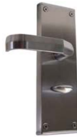
INSIDE LOCK BODY