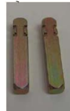
DRIVER SHAFT FOR HANDLES