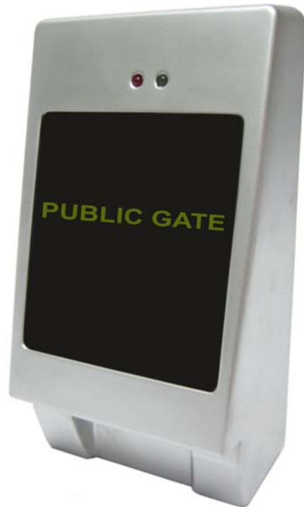
Card reader mounts on outside wall