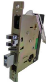
MORTISE WITH BUILT IN DEADBOLT