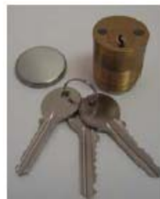
CYLINDER AND KEY SET